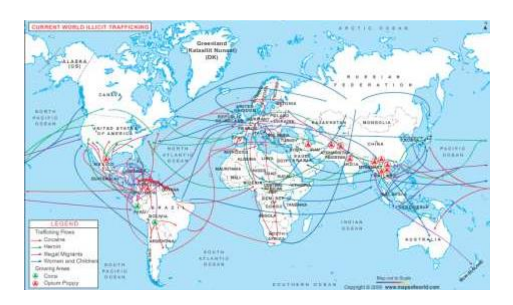
Figure 1: Current world illicit trafficking: 2014 [6]

Human rights concerns at sea are both a cause of, and a product of, the increasing criminal exploitation of the maritime and shipping environment. For example, maritime trade routes have long been used by criminal traffickers – Figure 1 shows maritime routes currently in use for the illegal movement of drugs and human beings around the world; the red and green lines are the routes used to move cocaine and heroin, respectively; while the purple line shows current movement of illegal migrants, and the blue line shows illicit trafficking in women and children.